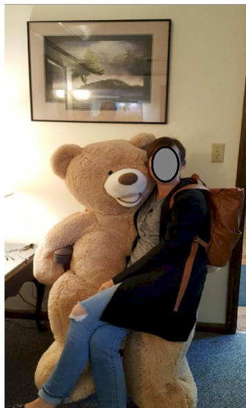
Buddy still loves hugs, and really enjoys when people pay attention to him. He watches over the office 24/7 and sometimes gets lonely. Won't you give him a hug the next time you see him?

Therefore, if you are feeling ANY KIND OF WAY - whether you have the common cold or are dying from a really bad case of the Plague, please leave your germs at home. Buddy will thank you! 😊